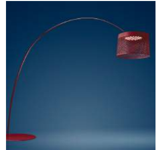
Twice as Twiggy Grid