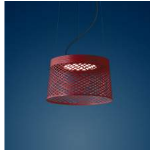
Twice as Twiggy Grid