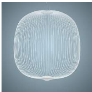
Spokes 2 Large