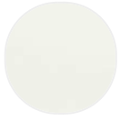
Matt lacquered white X042