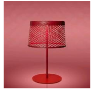
Twiggy Grid XL