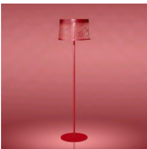
Twiggy Grid Lettura